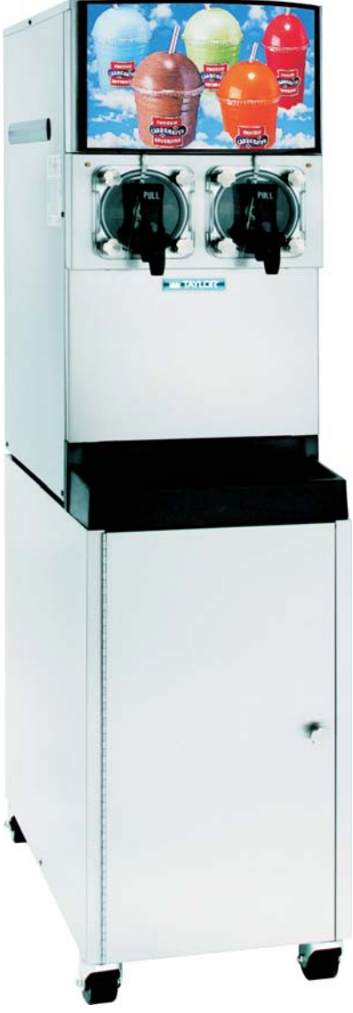
Shown with optional syrup storage cart