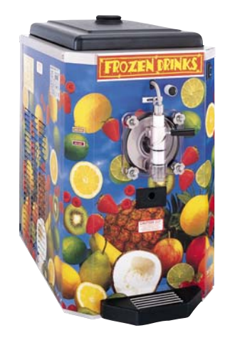
Shown with optional panel decals