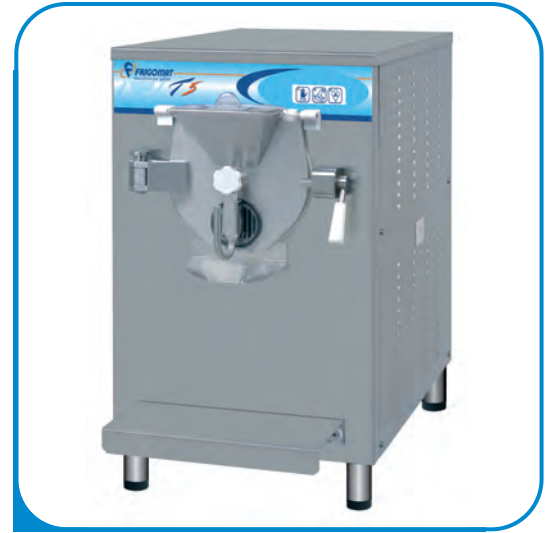
• T5S - counter-top model