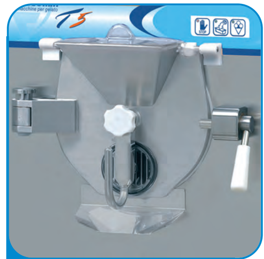
• stainless-steel door